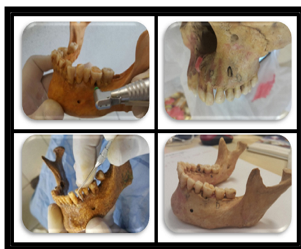
Fig. 1 The photographs of the maxilla and mandible that showing natural defect and simulated defects created with burr and chemical agent.

After preparing all jaws, radiology researchers (MM, MI) acquired intraoral radiographs using a Sorodex Digora Optime UV (Sorodex Medical Systems, Helsinki, Finland) and Planmeca Dixi 3 CCD (Helsinki, Finland). Periapical radiographs were obtained with a parallel technique by using a film holder apparatus to provide standardization. Phosphor plate system operating at 60 and 70 kVp with three different exposure time (0.16, 0.20 and 0.25 sec) and the CCD system operating at 60